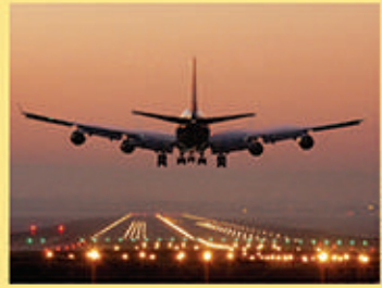
Proposed Greenfield International Airport