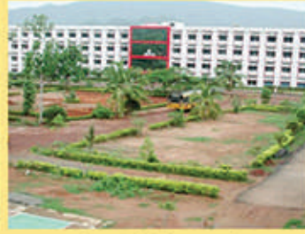
Avanthi Group of Institutions