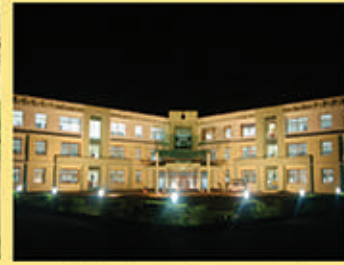
Miracle Software Park (GUM City)