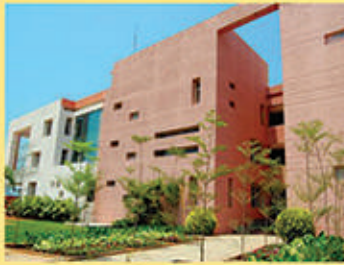
Oakridge International School