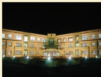
Miracle Software Park (GUM City)