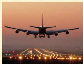
Greenfield International Airport