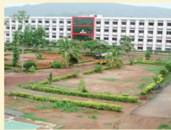
Avanthi Group of Institutions