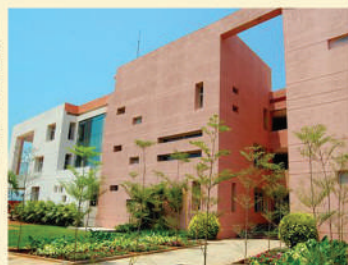
Oakridge International School