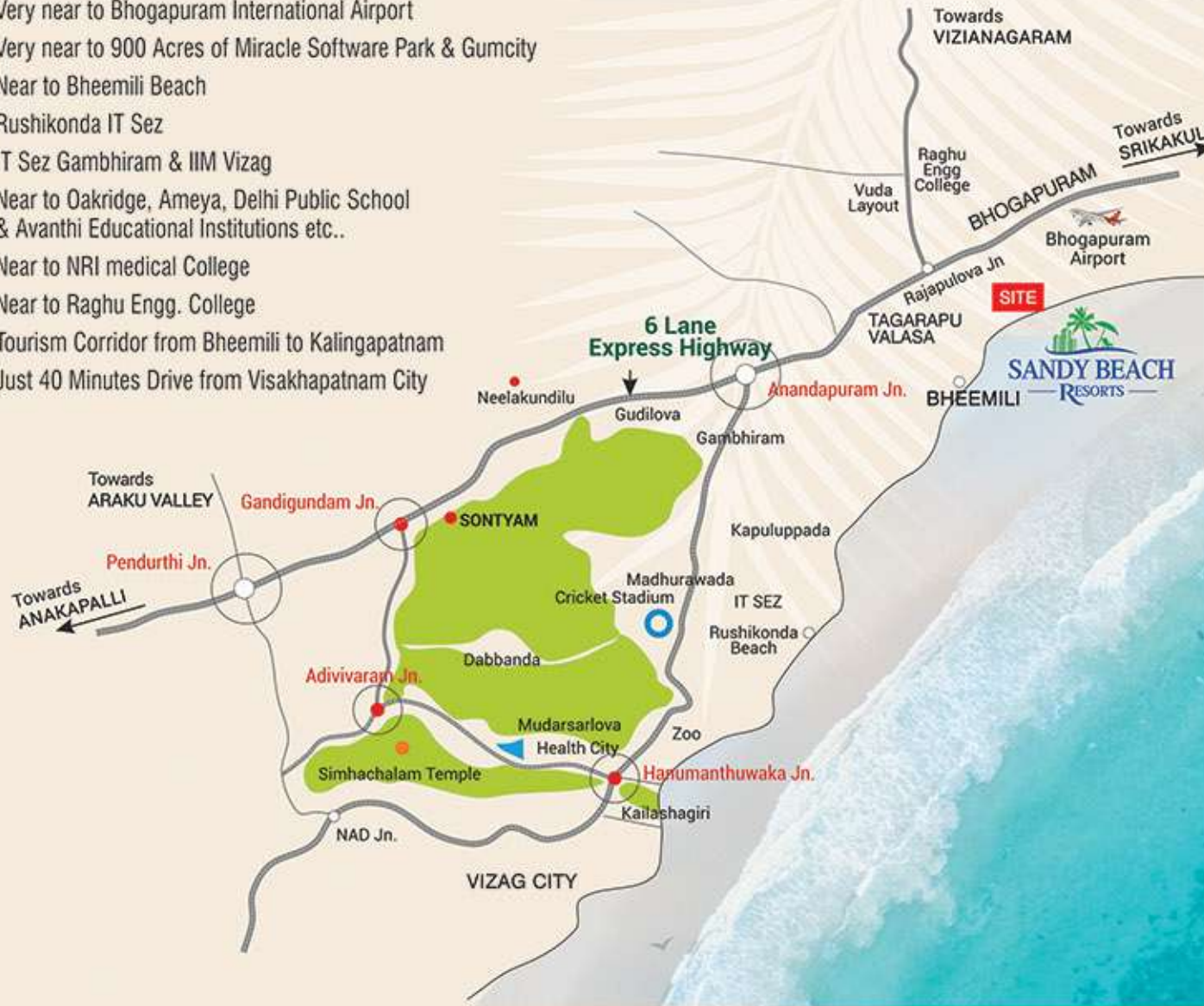
Location Map : (Not to Scale)