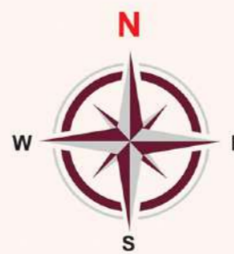
Plan Showing The Proposed Lay Out In Survey Nos. 10 & 14/P of Kancherupalem Village & Survey No. 262/P of Kancheru Village Bhogapuram Mandal Vizianagaram District