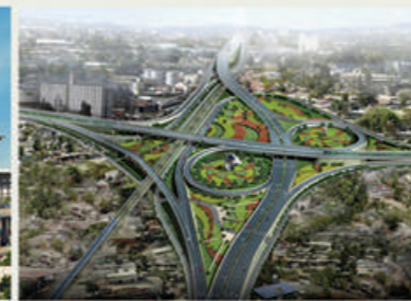
Regional Ring Road