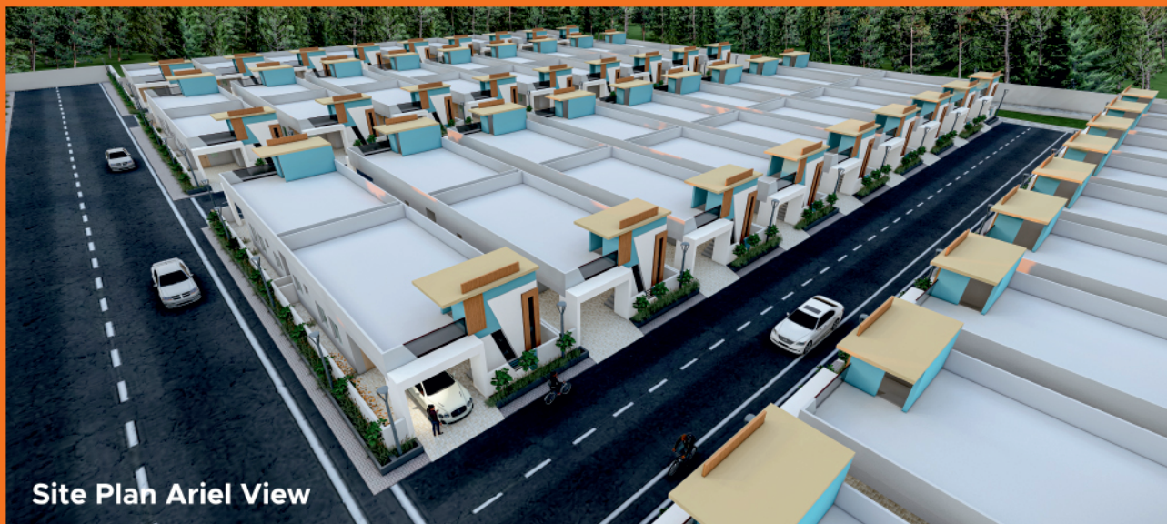
Site Plan Ariel View