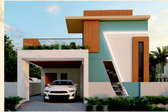
NORTH FACING ELEVATION Total Built up area 1130 Sq.ft