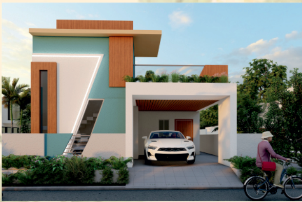
SOUTH FACING ELEVATION Total Built up area 1130 Sq.ft