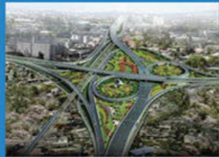
Regional Ring Road