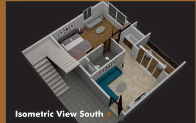
Isometric View South