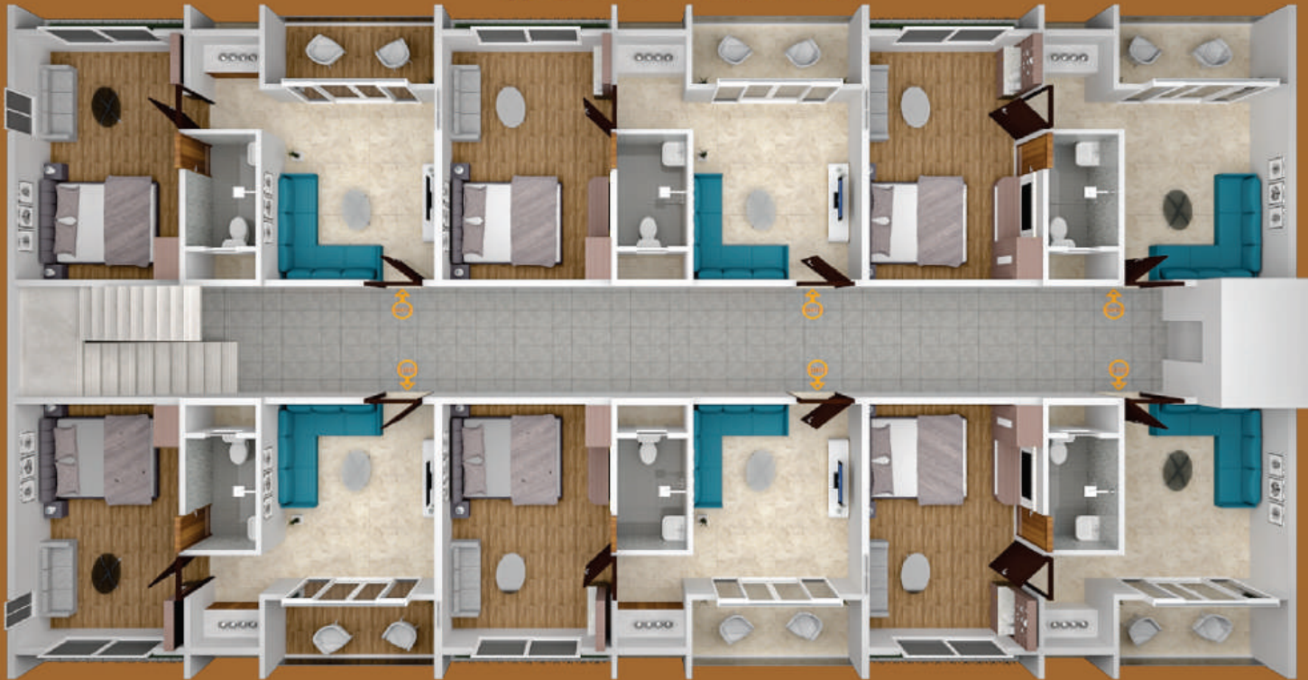
Typical Floor Plan (Top View)