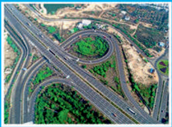
Regional Ring Road