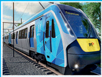
MMTS Rly Station